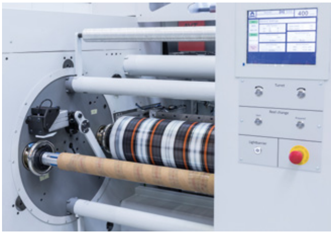
Turret style winders: Highly productive thanks to fully automated splices at production speeds of up to 400 m/min.