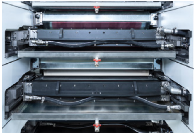
A solid design with 100 mm steel sideframes and outstanding stability as standard.